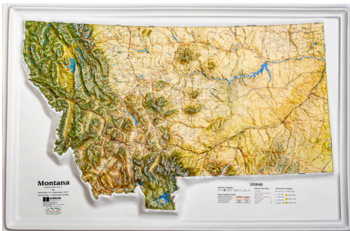
Montana Natural Color (HUB_MT_)