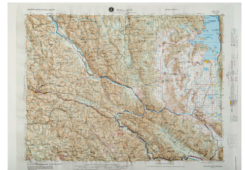
Wallace, Idaho (HUB_NL1103_)