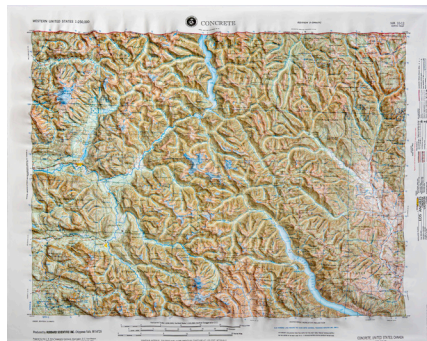
Concrete, Washington (HUB_NM1012_)