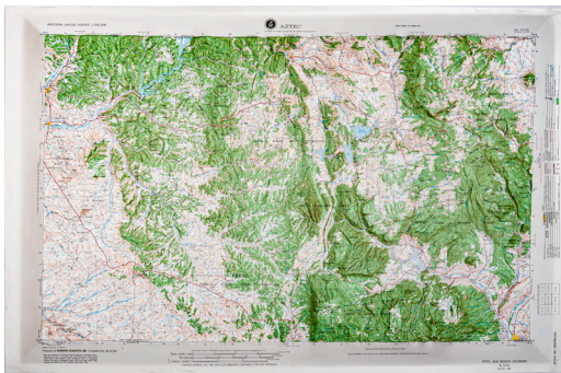
Aztec, New Mexico (HUB_NJ1310_)

This raised relief map covering Winston-Salem, North Carolina (sheet NJ 17-11) uses a USGS/DMA 1:250,000 topographic map as the base. Size: please inquire