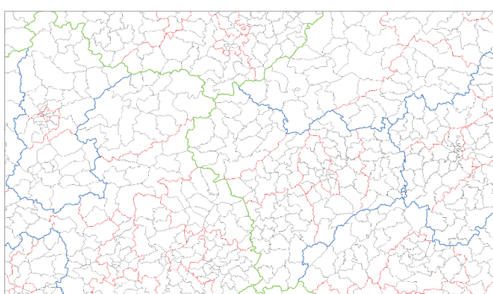
2010 ADM4/3/2/1 boundaries over Zhejiang and Jianxi provinces